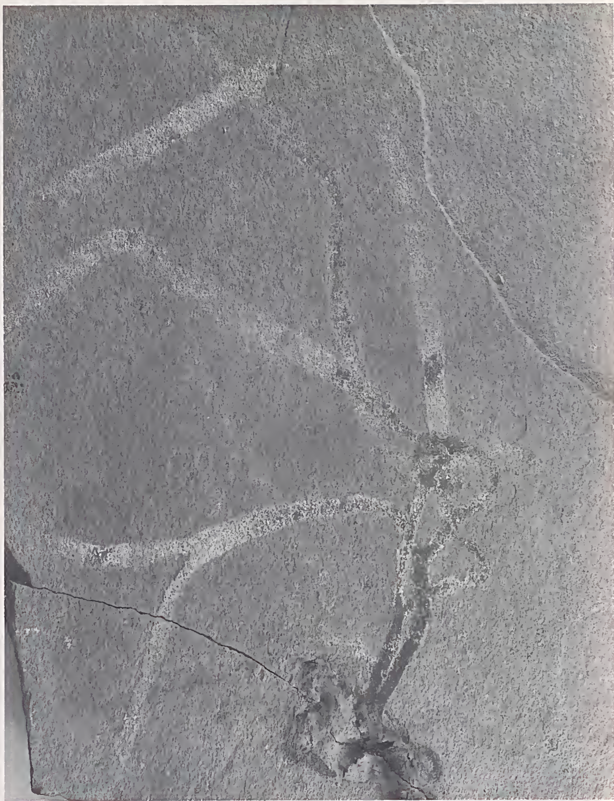
Fig. 2— Yeaia flexuosa sp. nov. Holotype, NMVP173478, \times 1 .